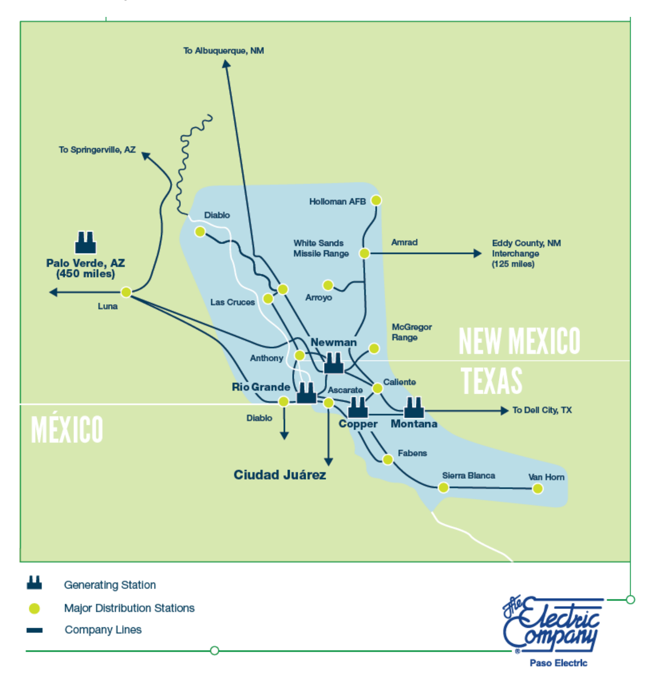
Figure 2 - EPE Service Territory and Electric System

The EPE service territory extends from west Texas to south-central New Mexico as illustrated in Figure 2. Copper, Rio Grande, Montana and Newman Generating Stations are located in the El Paso area. Palo Verde Nuclear Generating Station is located west of Phoenix, Arizona.