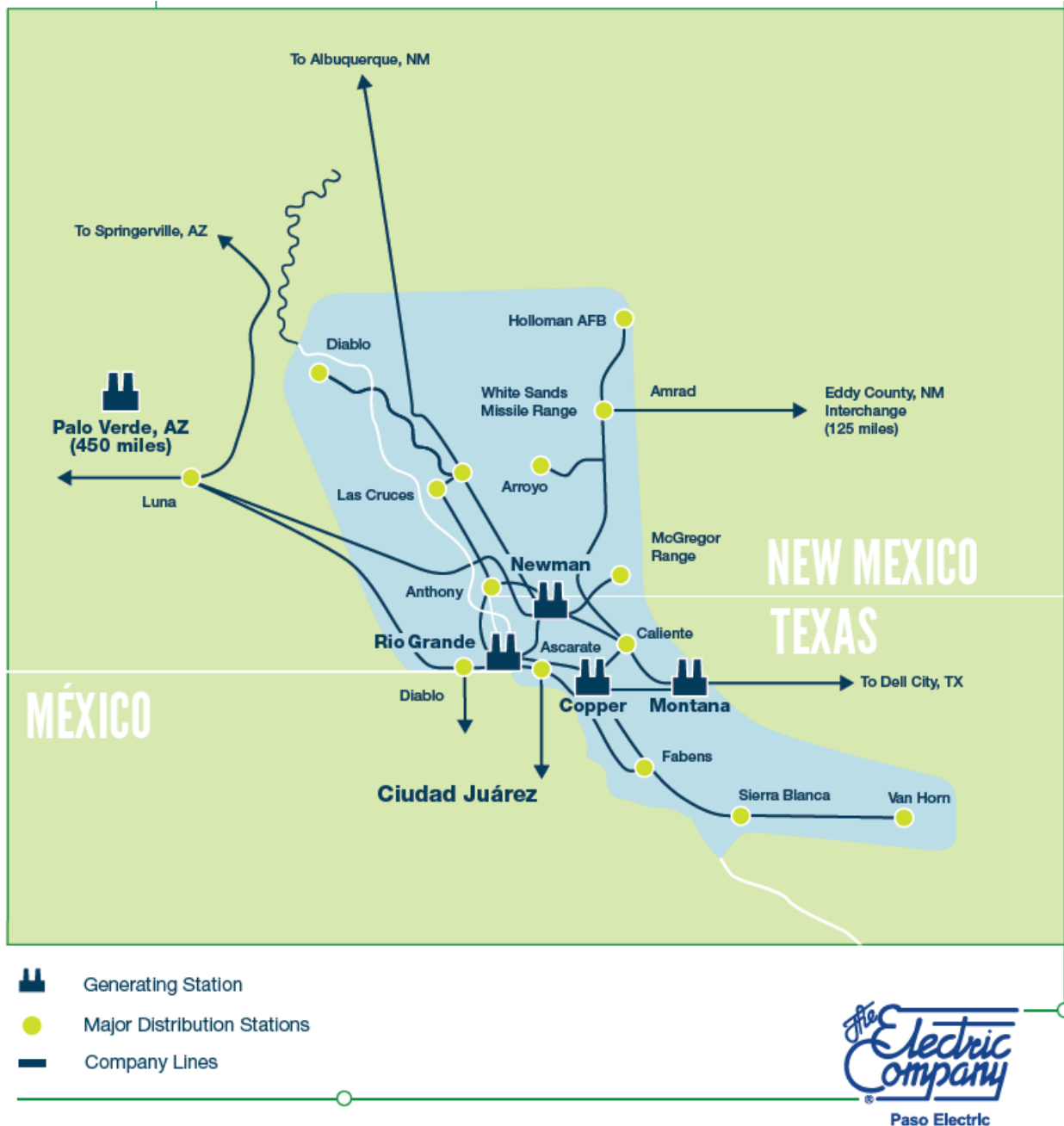
Figure 2 - EPE Service Territory and Electric System

The EPE service territory extends from west Texas to south-central New Mexico as illustrated in Figure 2. Copper, Rio Grande, Montana and Newman Generating Stations are located in the El Paso area. Palo Verde Nuclear Generating Station is located west of Phoenix, Arizona.